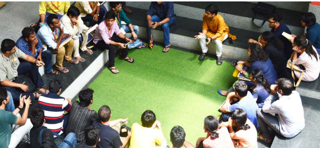
Special Interest Group discussing about Make In India