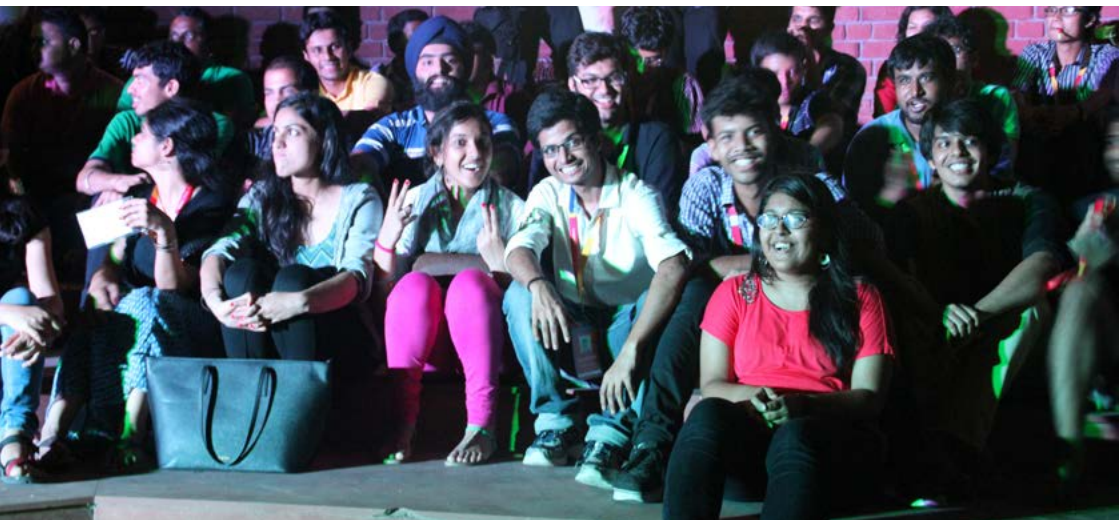
Cultural celebrations during farewell