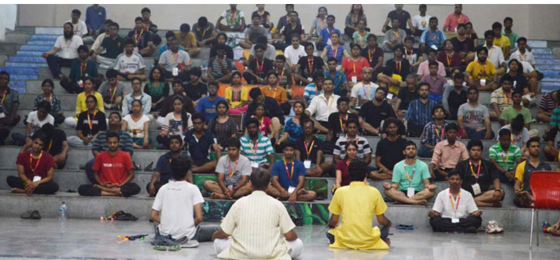
Meditation and pranayama on the International Yoga Day