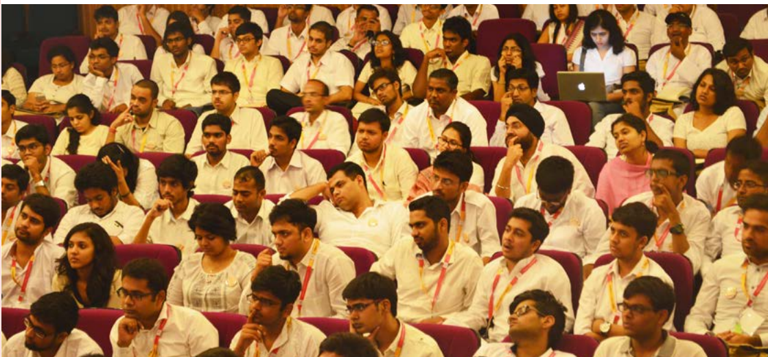
Delegates during Dr Jitendra Singh's talk, Delhi