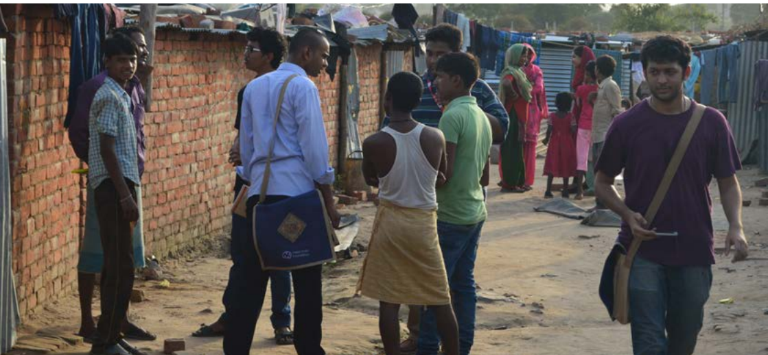
Field visit to Asawarpur village in Sonipat, Haryana