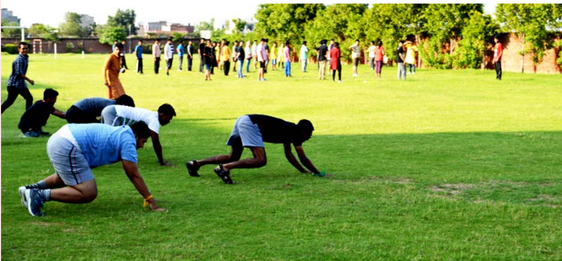
'Yoga Marathon' as part of International Yoga Day celebrations