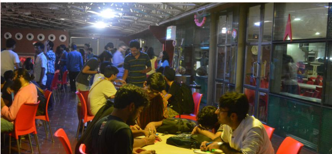
Working in groups on policy challenges