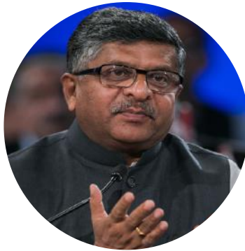
Sh. Ravi Shankar Prasad

Minister of Communication and IT, Govt. of India