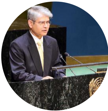
Sh. Asoke Mukerjee

Former Permanent Representative to United Nations from India