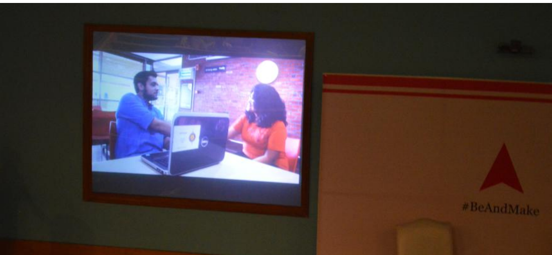
Video making as a part of campaign design activity