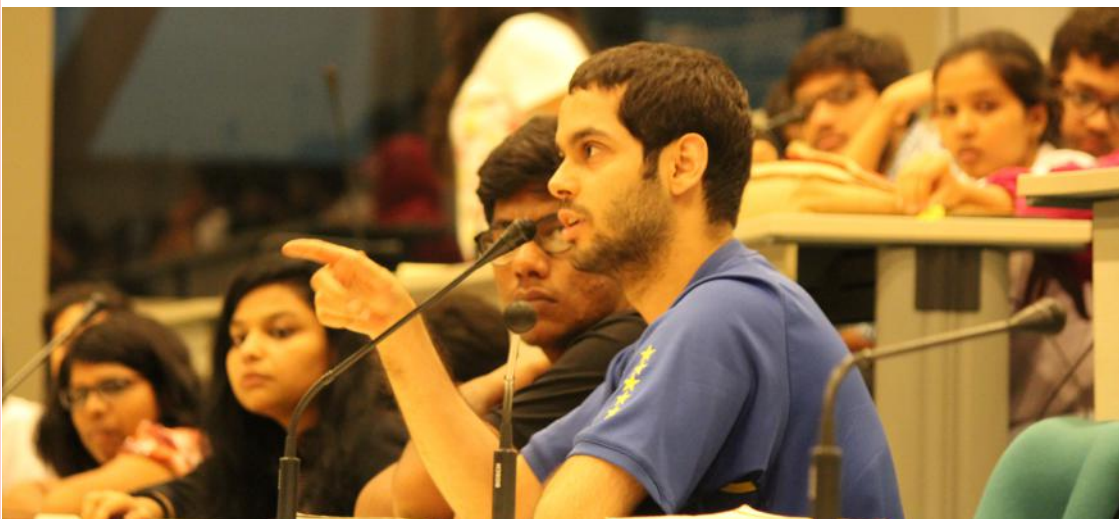
Engaging discussion during one of the peer-to-peer sessions