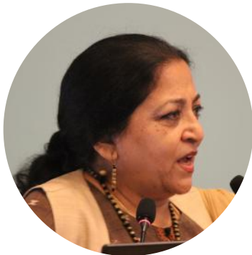
Dr. Madhu Kishwar

Founder, Manushi; Professor at Centre for Study of Developing Societies