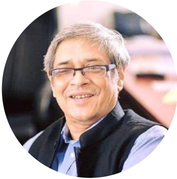
Dr. Bibek Debroy