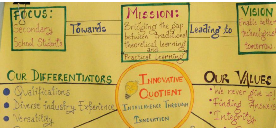
One of the ideas presented by a delegate during Idea Haat