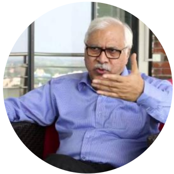
Dr. S.Y. Quraishi

Priorities of Indian Diplomacy: Stable relations with neighbours and enhanced influence in Intl. Organisations