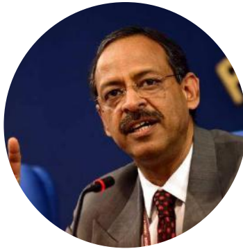
Sh. Anil Swarup