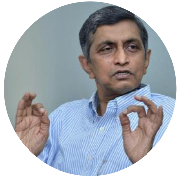
Dr. Jayaprakash Narayan

No monopoly accepts voluntarily without fighting and frowning a threat to its existence