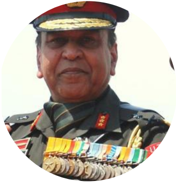
Lieutenant General Syed Ata Hasnain

Awarded PVSM, UYSM, AVSM, SM (bar), VSM (bar); Popularly known as 'People's General'