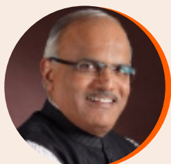
Sh. Vinay Sahasrabudhhe President, ICCR; MP, Rajya Sabha