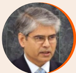
Asoke Mukerji Former Permanent Representative to the United Nations