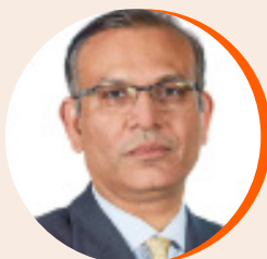
Sh. Jayant Sinha LS MP & Former Minister of State for Civil Aviation