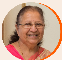
Smt. Sumitra Mahajan Former Lok Sabha Speaker