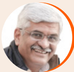
Sh. Gajendra Singh Shekhawat Cabinet Minister