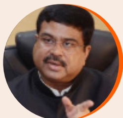
Sh. Dharmendra Pradhan Cabinet Minister