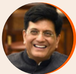
Sh. Piyush Goyal Cabinet Minister