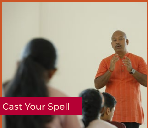
Cast Your Spell