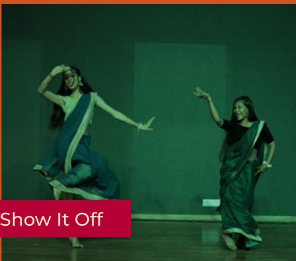
Show It Off