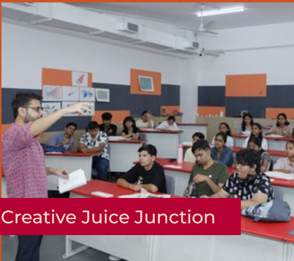
Creative Juice Junction

A key aspect of ISS 2023 is to make learning fun. We took the help of workshops and activities to help students learn various lessons and explore aspects of life through workshops and activities. Learners engaged in a summer carnival, treasure hunt, theater, and storytelling, learned to build a business, explored creative processes and Indian culture.