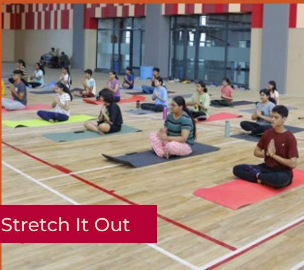
Stretch It Out

It is important to start the day right and so we began each day with an “Energizer” hour by introducing students to yoga, chanting, meditation and nature walks. The idea was to wake them up with some reflective practices to connect with themselves, gather their energy, and ground them before they begin their day.