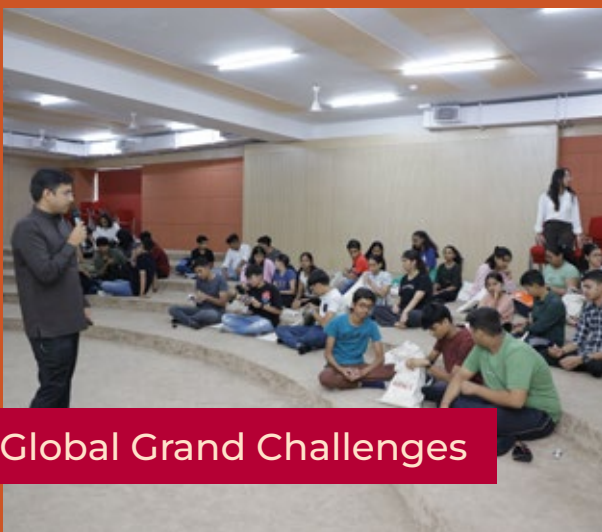
Global Grand Challenges

Building Global Perspective and Solving Problems