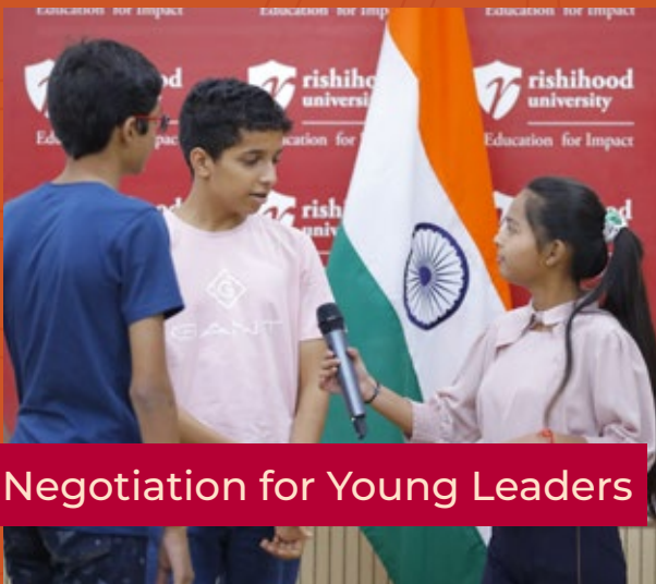
Negotiation for Young Leaders

To channelize their energy, the day formally began with the “Focus Hour” where students dived deep into subjects that are set to take over the world in the coming decades including communication and negotiation skills, new age career paths, AI and future technology, sustainability and more.