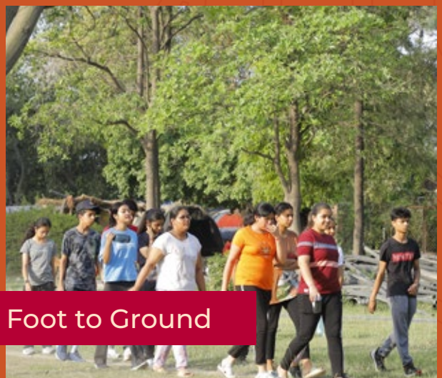
Foot to Ground