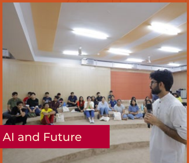
AI and Future

Building Global Perspective and Solving Problems