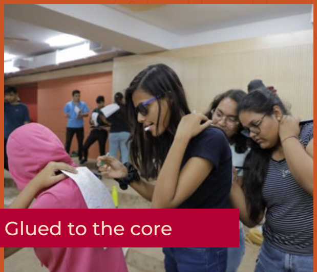
Glued to the core